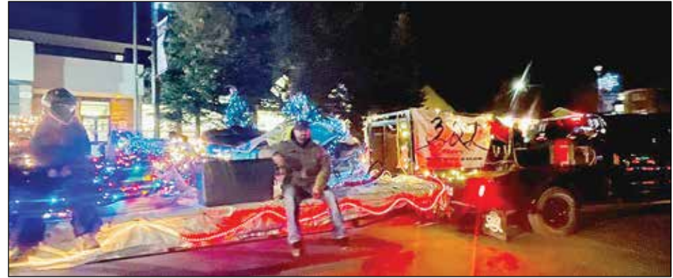
307 Riders in the parade.

governor has set up the outdoor recreational collaboration around the state to promote outdoor rec. in this venture they have created a map that has all sorts of info in one spot. Here is the web site: https://wyooutdoorrecreation.wyo.gov/ and the map can be found here https://beta-6rhgzy-3wzx3h55cenfe.us-2.platformsh.site/ Check out the map for your area and see what is going on there. Oh, and don't forget that Fun Days is in Rock Springs this year So mark your calendar for March 4-6 for a great time. Registration time has started. Keep Up the SNOW DANCES.