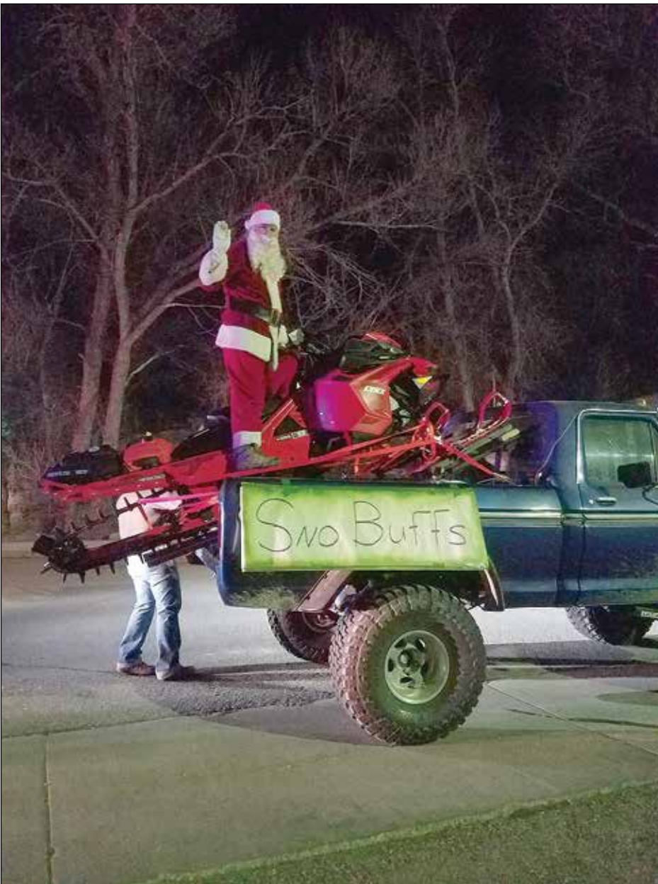
Santa on the Powder River Sno-Buffs float.