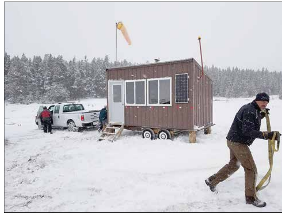
Web Creek safety shelter.