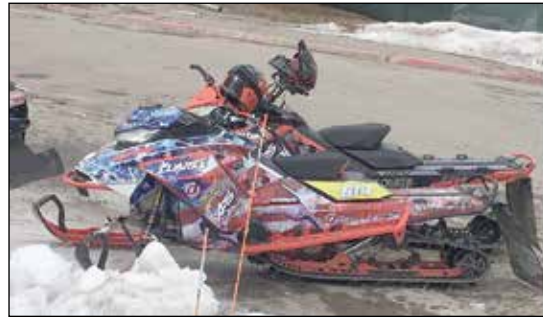
At the Hill Climb 2021.