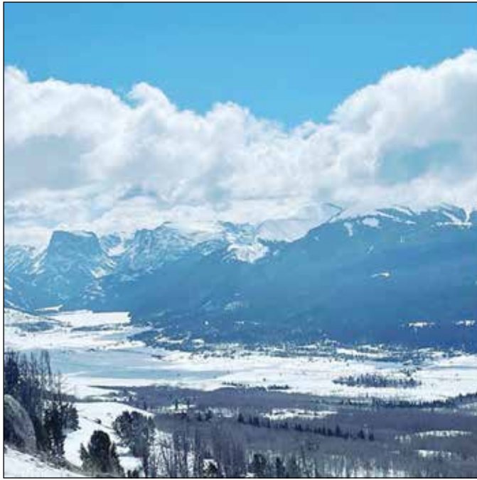
Square Top in the Wind River Range