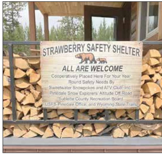
Welcome to the safety shelter at Strawberry.