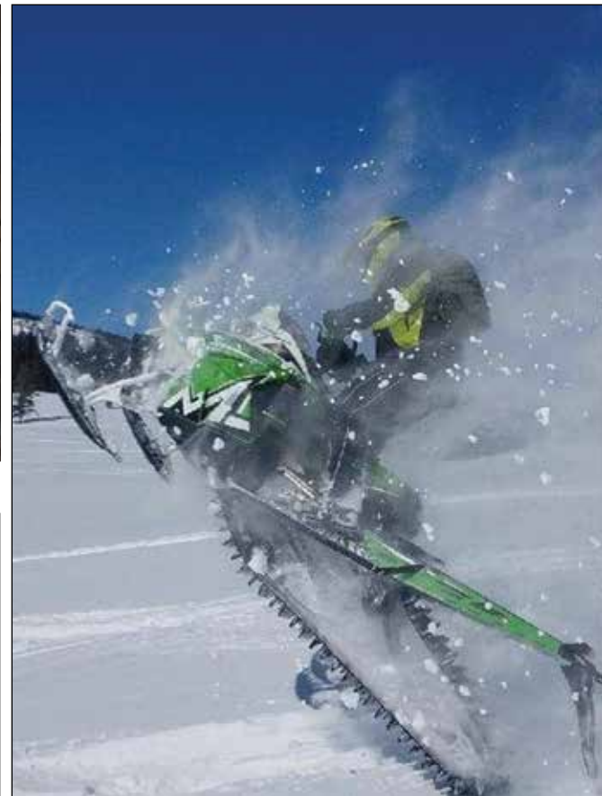
Fun riding in March!