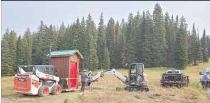
Move that outhouse!