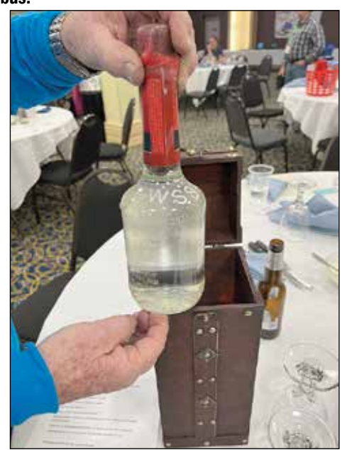
The schnapps bottle will be engraved with the year and name of the Snowpokes.