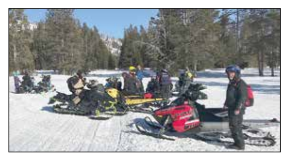
After a bluebird day of riding, headed home.