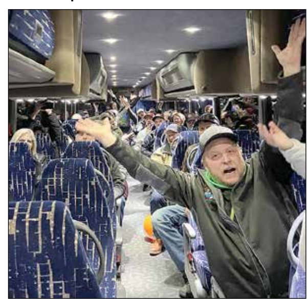
Pub crawl bus.