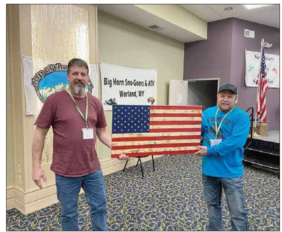
Drawing for Veterans.