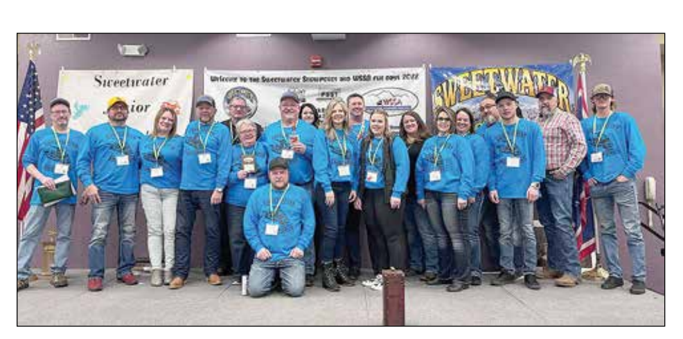
This year's Schnapps Bottle auction winners, Sweetwater Snowpokes.