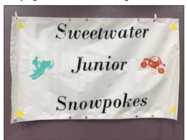
Junior Snowpokes banner.