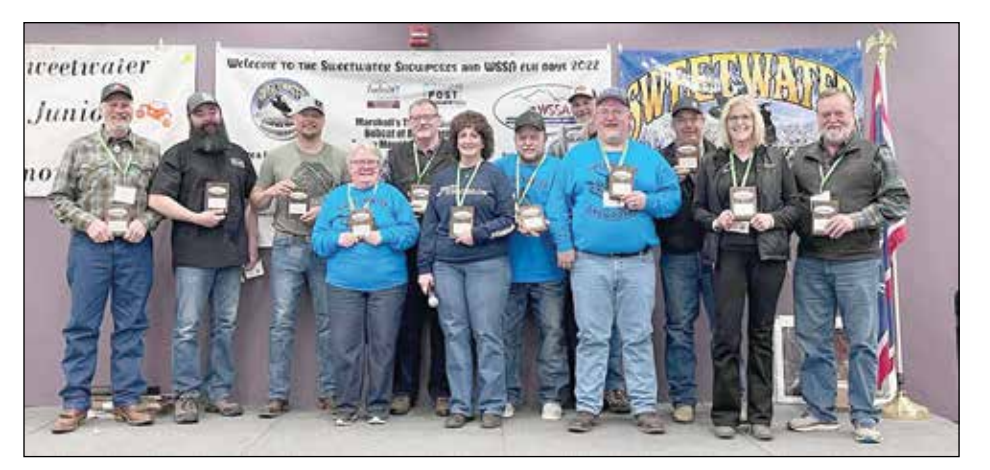
WSSA Award Winners in attendance at Fun Days.