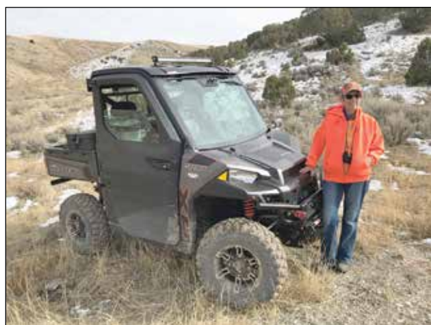
ATVing south of Rock Springs.

NOVEMBER Highway 191 South cleanup (look for sign about mile marker 523) Horse Creek - move "Are You Beeping?" sign to trail DECEMBER Dec. 3- Lighted Holiday Parade