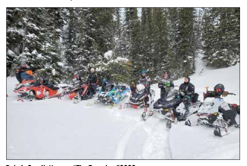
Dubois Sno-Katters on "The Boundary" 2023.