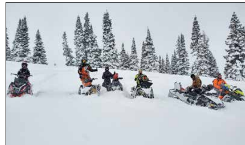
Sno-Katters in Alpine.

Hello again everyone from the Dubois Sno-Katters