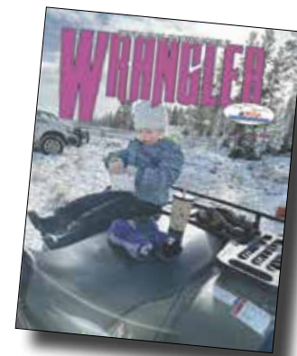
The youngest member of the Dubois Snowkatters takes a break from helping the club get the safety shelters outfitted for the season.