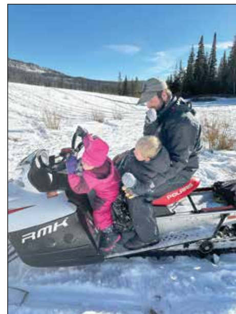
Taking a ride.