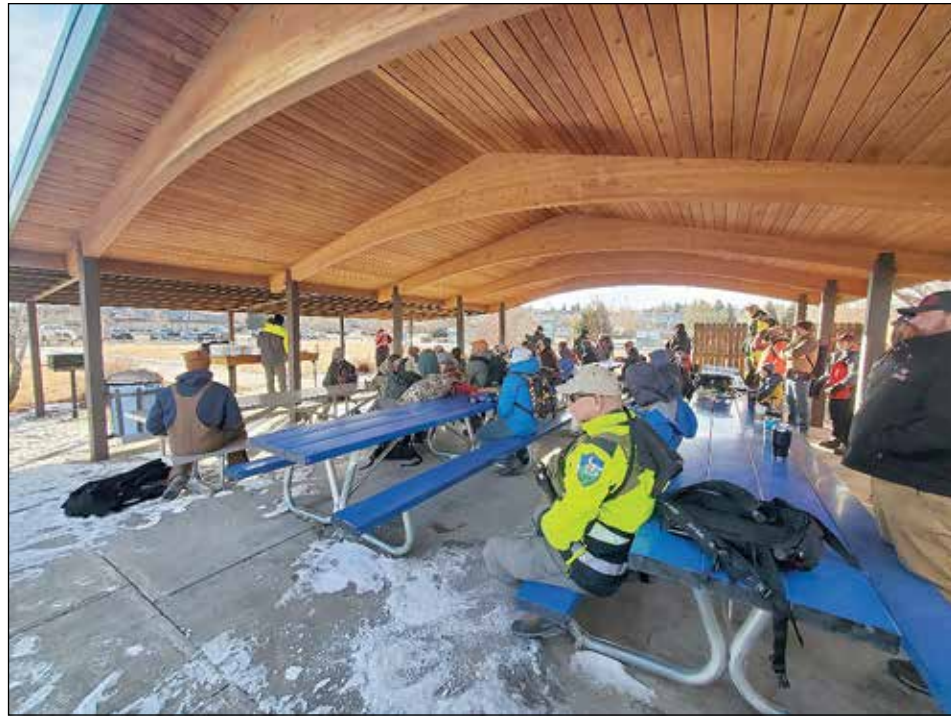
Avalanche Field Day.

Saturday, we held the field day training. We usually go up the mountain and do our field training but due to the low levels of snow we decided to play it safe and do our training in a local city park. Our attendance was good considering the cold wind. We had about 55 folks for field day training. The trainers set up a beacon park that was very impressive. We want to thank all our sponsors for helping us to host the Avalanche Training free of charge. We were able to have drawings for great prizes like Avy beacons and Avy back packs and much more. We also gained a few new members.