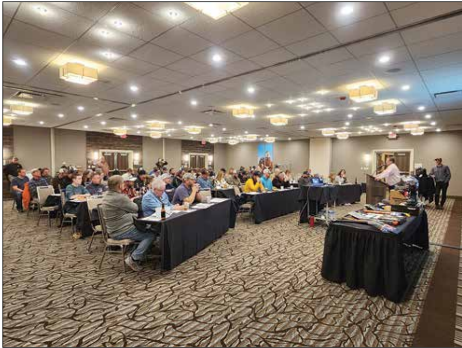
Avalanche Class 2024.