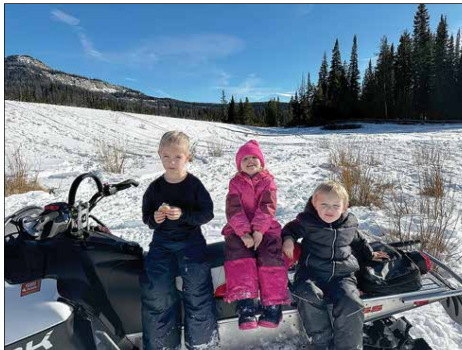
Youngsters on a sled.

Our club is excitedly preparing for WSSA Fun Days this coming March. The Sno-Katters are fortunate to have a strong backing of associate members and members willing to help in so many ways. In our preparation for Fun Days, I've