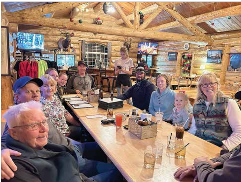
Dinner at Crooked Creek.