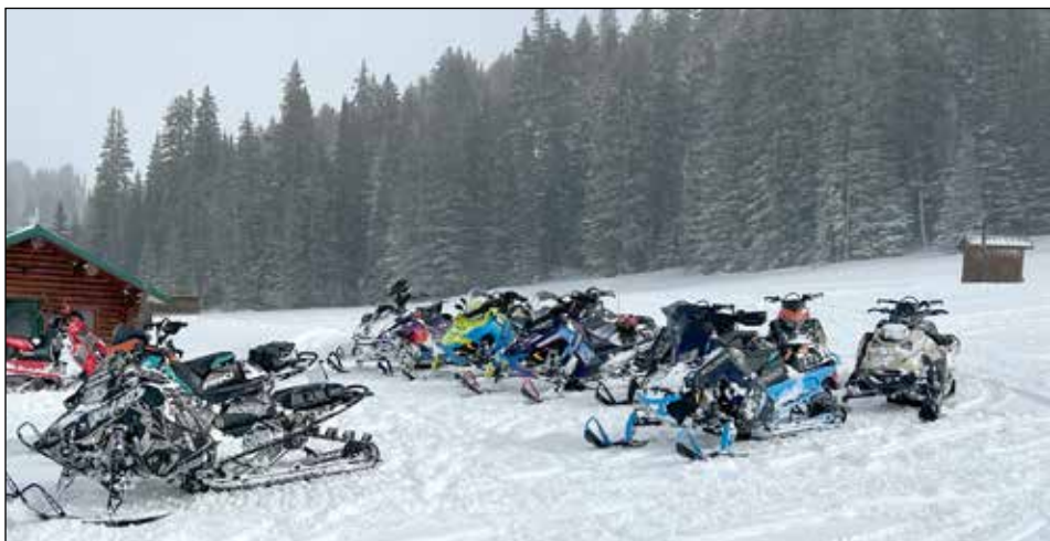
February 9, Junior Snowpokes Rider Introduction