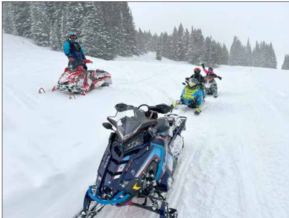
February 8, Box Y Ride