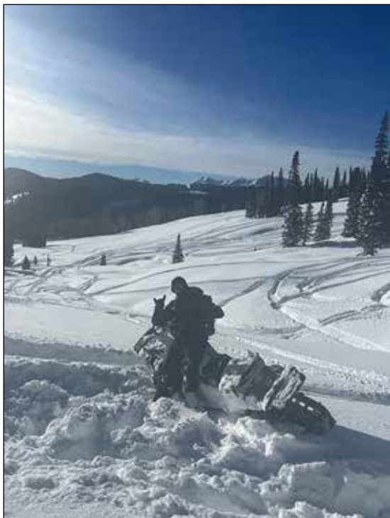
A recent day in fresh powder.