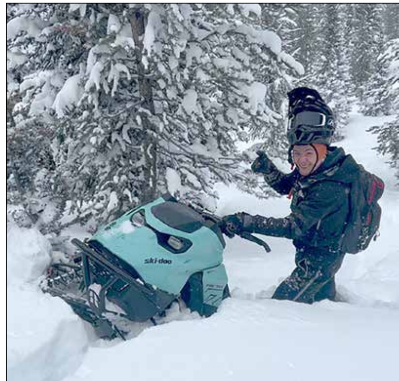
Must have been a great day - Look at that smile!