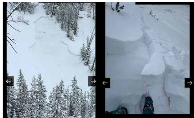
(1/2/2025) These avalanches occurred across north and south aspects at middle and upper elevations at Togwotee. Every recent avalanche has failed on weak snow near the base of the snowpack (~8-10 inches up from the ground)