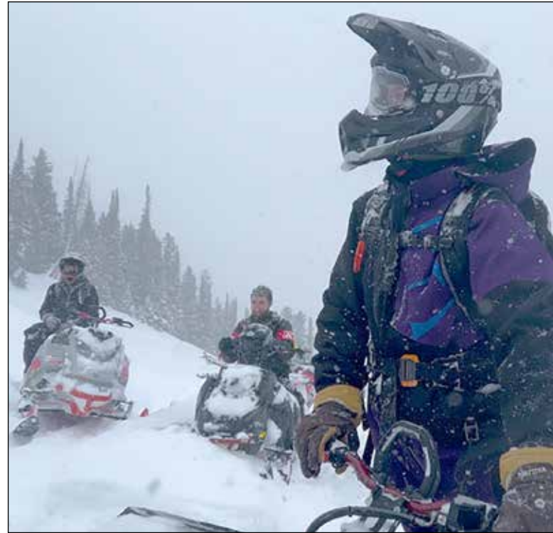
What's up there?