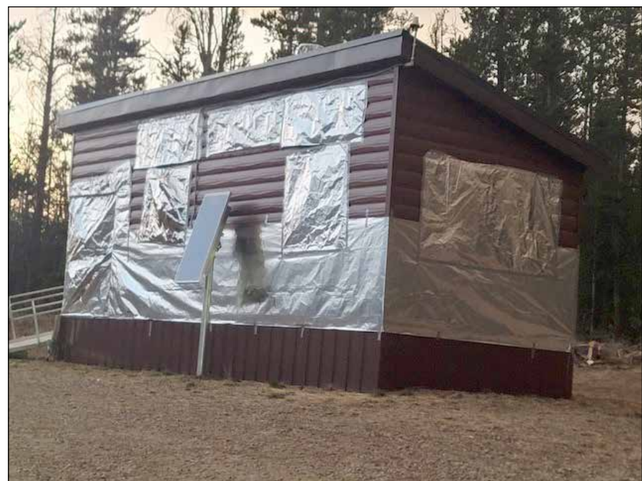
CLOCKWISE FROM TOP LEFT: Close to Strawberry Safety Shelter and Fish Creek Guard Station. Strawberry Safety Shelter was wrapped and combustibles were cleared away. Fish Creek Guard Station buildings wrapped.

There may be a significant amount of damage to the trails which will affect snowmobiling in the area. Once declared safe to enter the area, Wyoming State Trails and others may be busy clearing and marking the routes for snowmobile trails. please be aware of trail information pertaining to the fire areas.