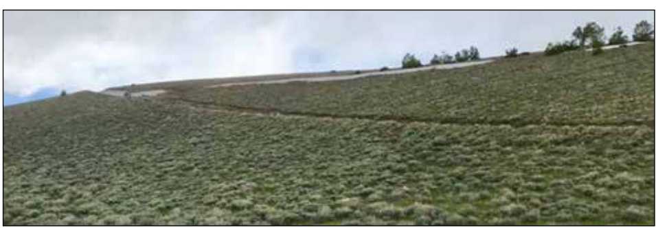
June 1 Fun Run - not too bad on that snow-covered section (see May 29).

Deadline for the next Wrangler is December 4