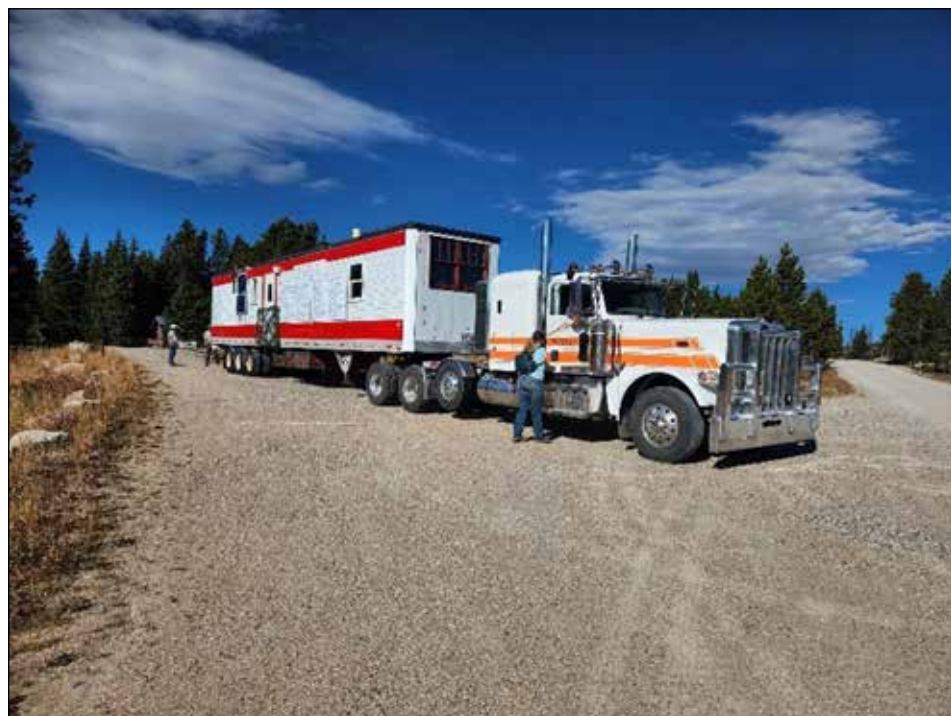
Home for the winter - Island Lake Campground.