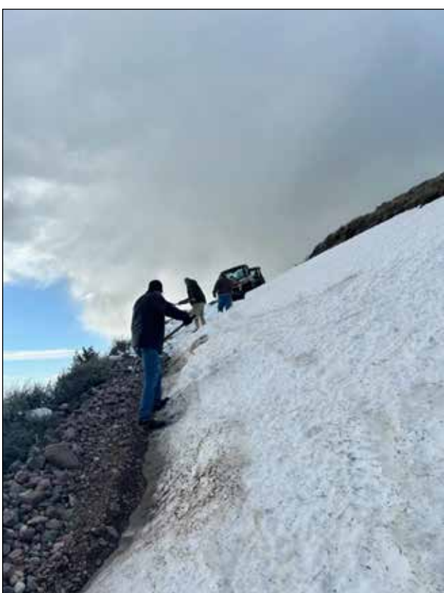
Prepping the trail on May 29.