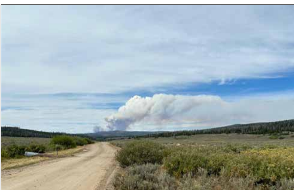
Fish Creek Fire on August 17.