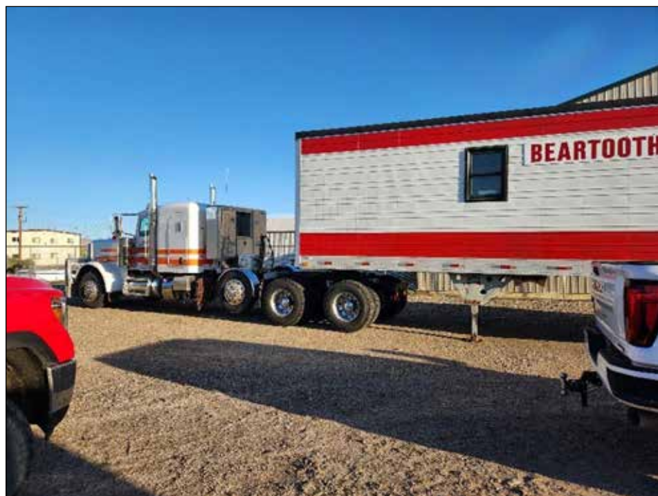
Leaving town heading to the mountain.

PRESORTED STANDARD US POSTAGE PAID SPEARFISH SD PERMIT #77