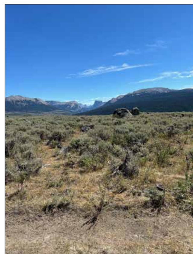
Square Top from route of August Fun Run.