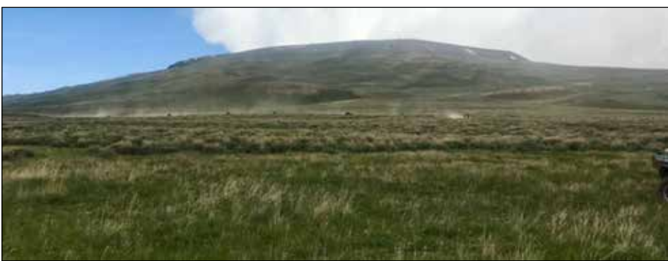
Can you see the dust and all the UTVs?

The Fun Days 2025 committee is finalizing the registration form which will be available online soon. In addition to the club facebook page, we now have a website at SweetwaterSnowpokes.com.