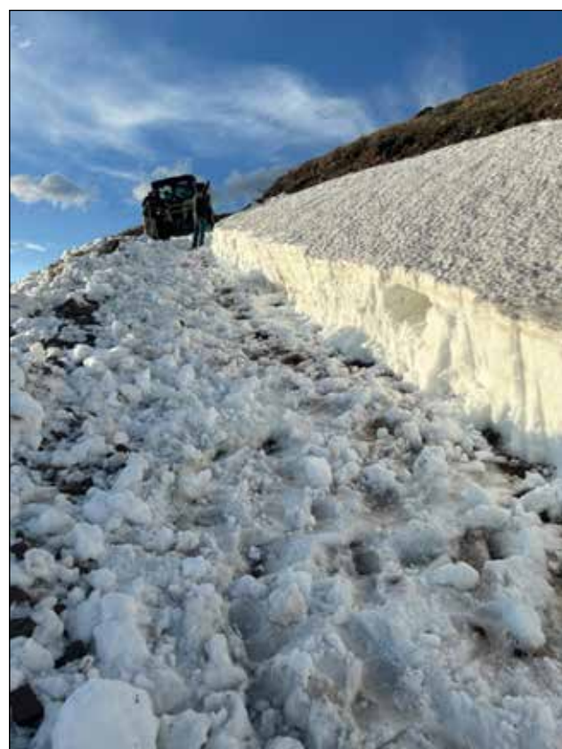
Will it be muddy or wet on June 1?